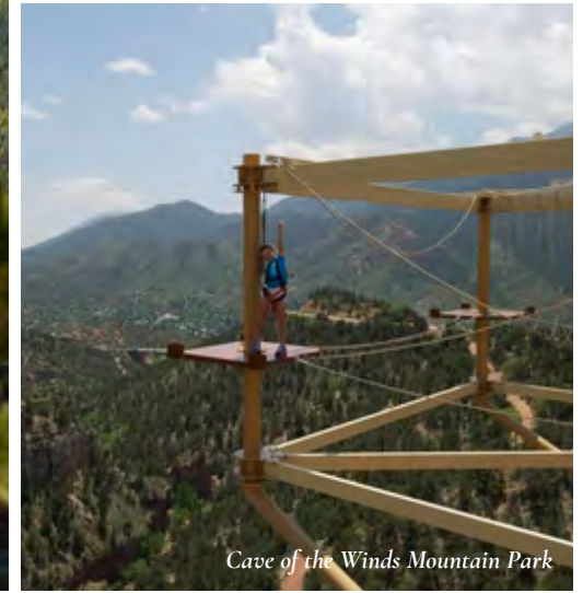
Cave of the Winds Mountain Park