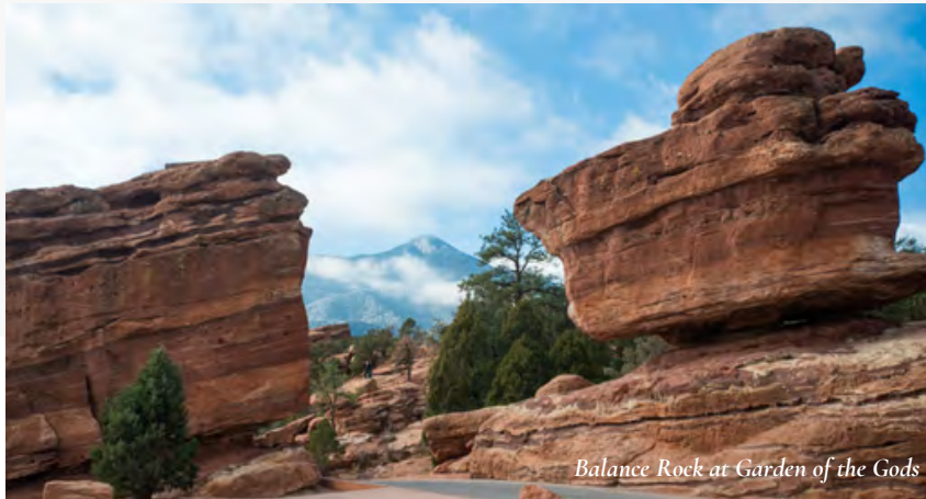
Balance Rock at Garden of the Gods