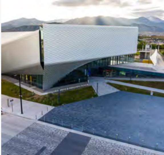
U.S. Olympic & Paralympic Museum