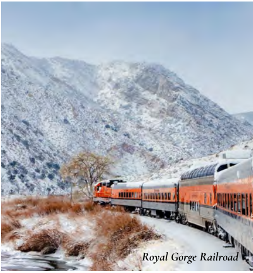
Royal Gorge Railroad