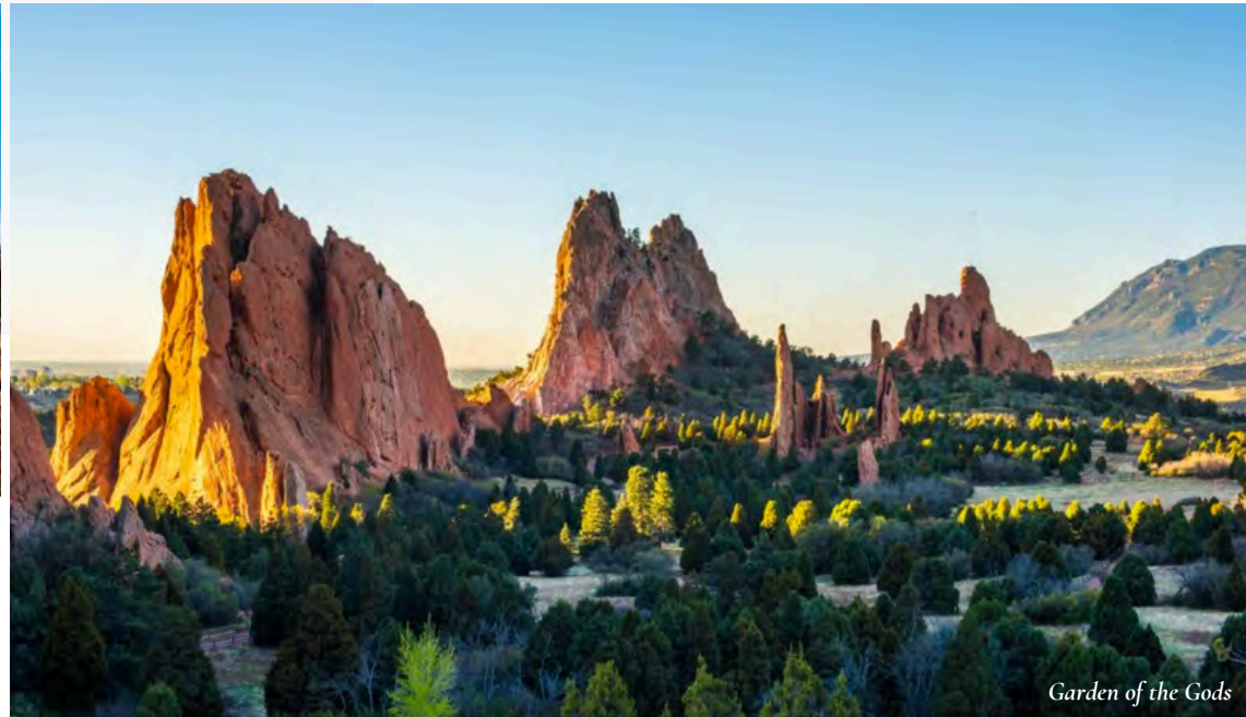
Garden of the Gods