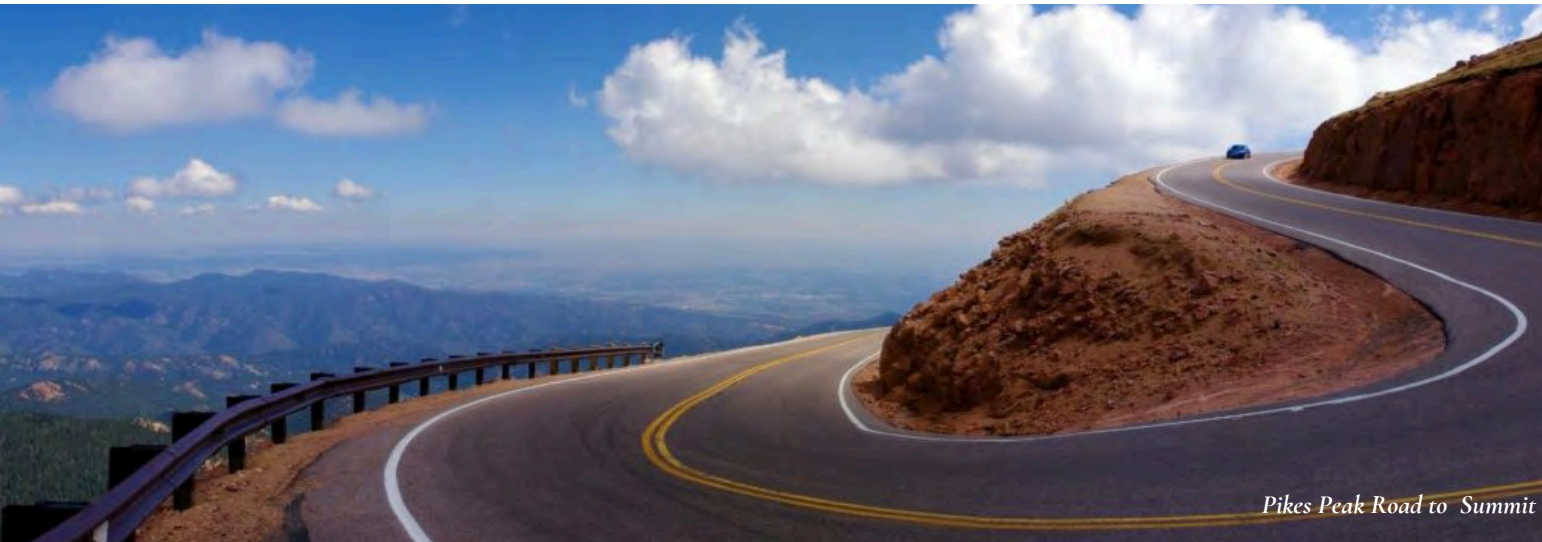
Pikes Peak Road to Summit