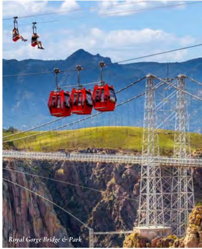
Royal Gorge Bridge & Park