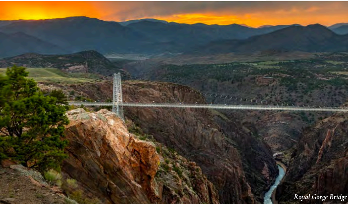
Royal Gorge Bridge

Travel south through scenic mountain landscapes to the Royal Gorge region near Cañon City for a full day of canyon scenery and frontier history. Begin at Royal Gorge Bridge & Park, where elevated walkways, panoramic viewpoints, and optional gondola or adventure experiences showcase one of Colorado's most dramatic landmarks, suspended nearly 300 metres above the Arkansas River. Continue into the canyon for your Royal Gorge Route Railroad experience. Settle into reserved deluxe seating for a 2.5-3 hour scenic journey as the train follows the river through the narrow gorge, offering relaxed viewing of sheer canyon walls, rock formations, and historic rail engineering. On the return to Colorado Springs, take the optional Skyline Drive near Cañon City, a short but dramatic ridge-top route offering sweeping views over the Royal Gorge region. Tonight enjoy a relaxed final evening in Colorado Springs, reflecting on a day of canyon landscapes, dramatic geology, and classic Rocky Mountain scenery.