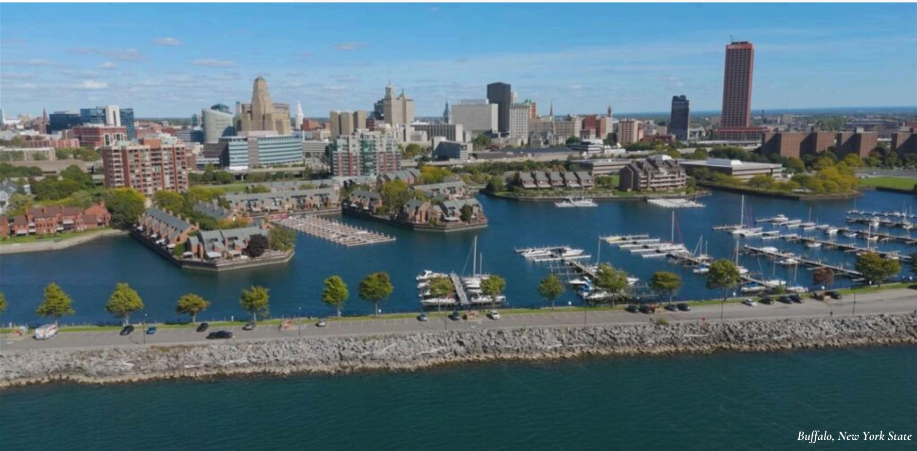
Buffalo, New York State