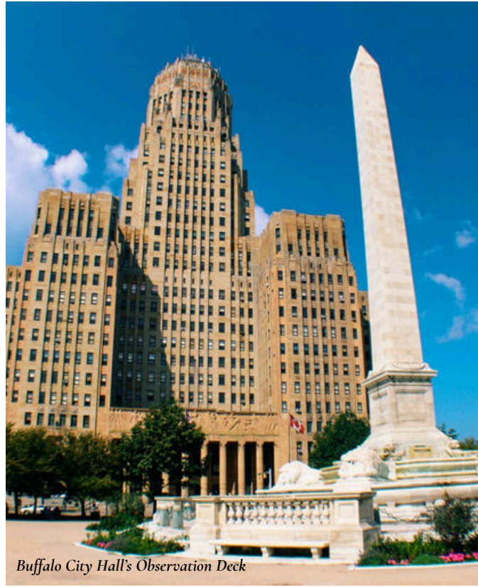
Buffalo City Hall's Observation Deck