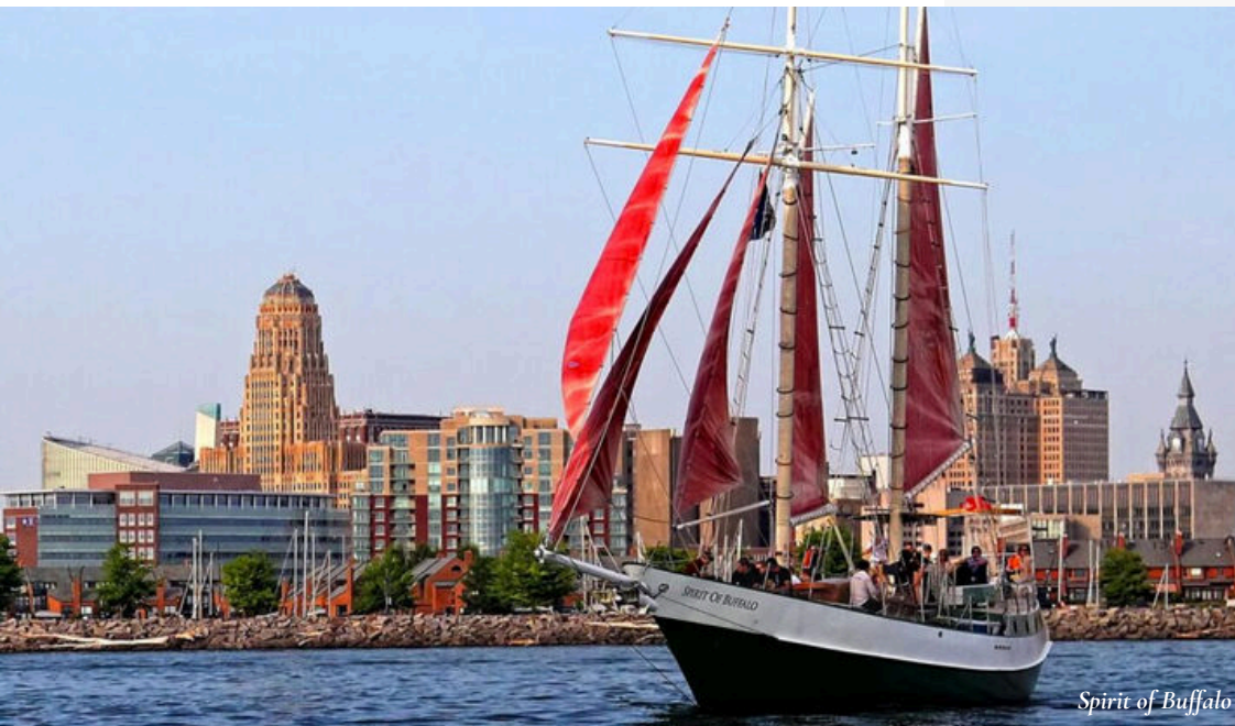
Spirit of Buffalo

Begin the day with panoramic views from Buffalo City Hall's Observation Deck, offering a clear perspective over the city's historic grid and lakeside setting. Continue to the Buffalo Naval & Military Park, where preserved vessels and memorials reflect Buffalo's maritime heritage and connection to the Great Lakes. Explore the Buffalo River and Silo City district, where former grain elevators and industrial waterfront spaces have been transformed into creative cultural landmarks, showcasing Buffalo's regeneration story. In the late afternoon, return to Canalside to board the Spirit of Buffalo for an Evening Sail across Lake Erie. Watch the skyline glow as the sails catch the evening light and the city transitions into night. After disembarking, enjoy dinner at Buffalo RiverWorks, a lively waterfront venue set within the city's revitalised industrial riverfront, bringing your final full day in Buffalo to a memorable close.