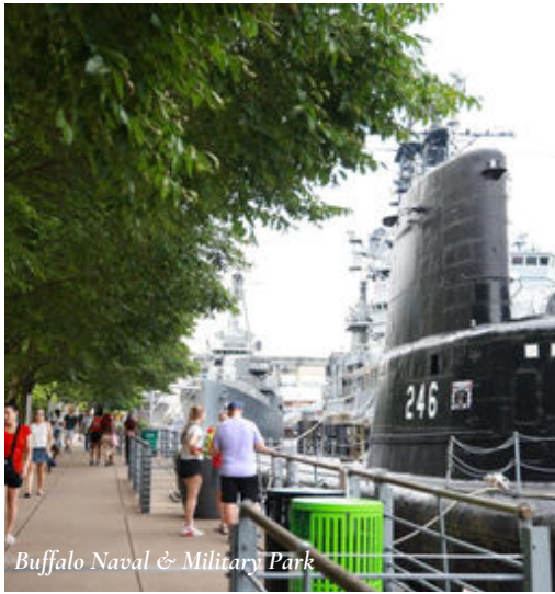
Buffalo Naval & Military Park