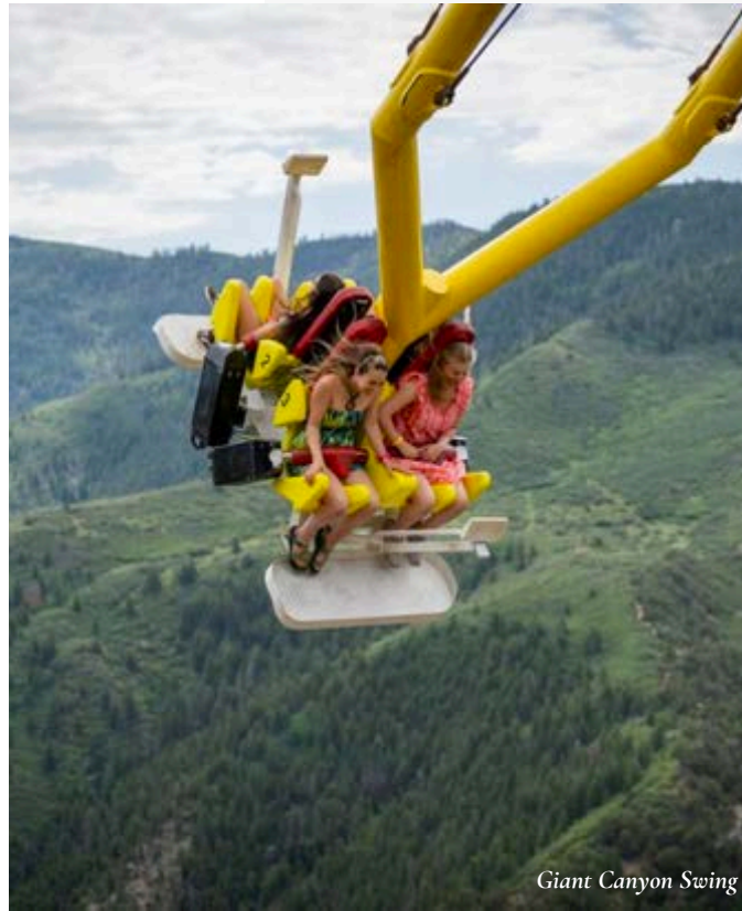
Giant Canyon Swing