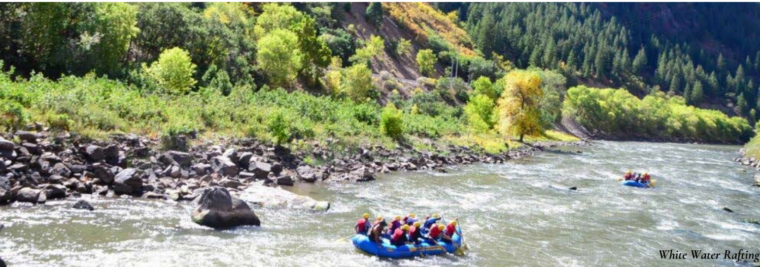
White Water Rafting