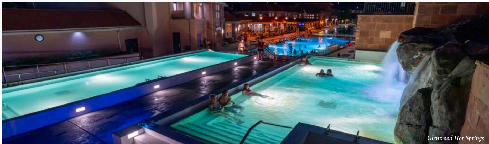
Glenwood Hot Springs

Spend your final morning in Glenwood Springs on a guided white-water rafting adventure along the Colorado River. Rapids vary to suit all skill levels, offering both excitement and a unique perspective of Glenwood Canyon's rugged cliffs, flowing waters, and local wildlife. Navigate iconic Class III-IV rapids such as Shoshone, Tuttle's Tumble, and Tombstone, feeling the rush of the river while surrounded by dramatic mountain scenery. After rafting, enjoy a leisurely scenic drive through Glenwood Canyon, stopping at overlooks to capture final photographs and appreciate the grandeur of the Rockies one last time. If time allows revisit Glenwood Hot Springs for a soothing soak or take a peaceful riverside stroll, reflecting on the adventures of the past days. Depart Glenwood Springs by car for your next destination, carrying memories of relaxation, excitement, and stunning landscapes - a visit that will leave you inspired by the region's natural wonders and the adventurous spirit that defines this mountain town.