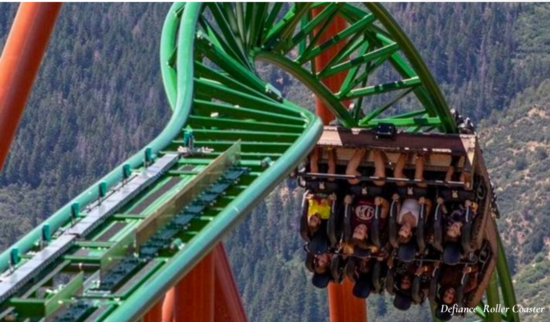
Defiance Roller Coaster

Spend the day at Glenwood Caverns Adventure Park, perched atop Iron Mountain. Start with the gondola ride, offering sweeping views of Glenwood Canyon and the Rockies. Pause at the Iron Mountain Overlook for panoramic valley vistas and photo opportunities before stepping into a world of adventure. Explore the underground Fairy Caves and King's Row with guided tours revealing fascinating geological formations. Thrill-seekers can ride the Defiance Roller Coaster, Alpine Coaster, and Giant Canyon Swing, while families enjoy 4D theatre, laser tag, and gemstone panning. Short scenic trails provide additional views of the canyon below. After a full day of adrenaline and exploration, unwind at Iron Mountain Hot Springs, soaking in mineral-rich pools with river and mountain vistas. End your day with dinner at The Pullman, serving contemporary American cuisine crafted from locally sourced ingredients. Today offers a perfect blend of thrills, scenic beauty, and promises to be one of the highlights of your Glenwood Springs adventure.