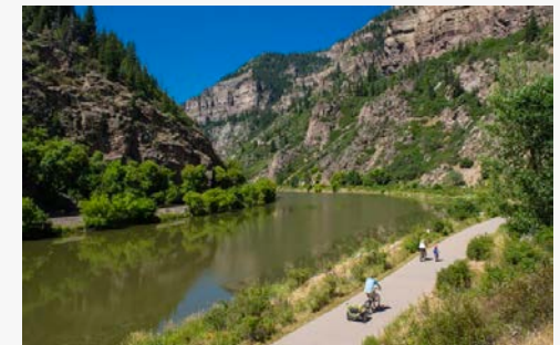
Glenwood Canyon Recreation Path