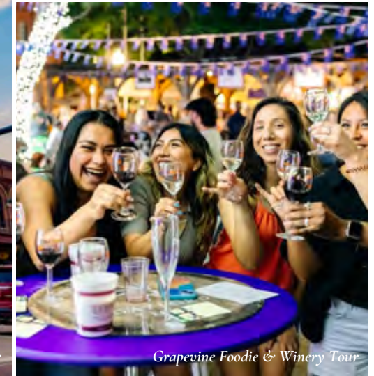
Grapevine Foodie & Winery Tour