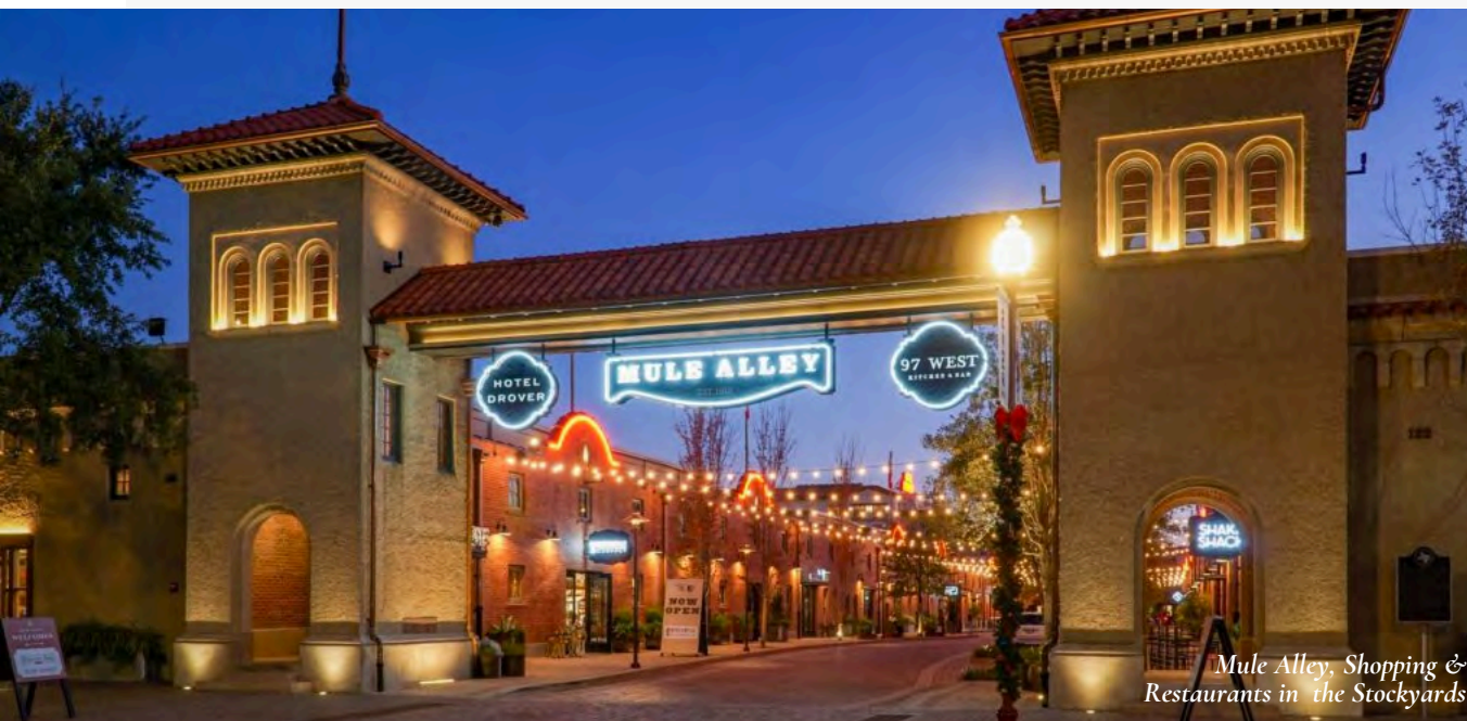
Mule Alley, Shopping & Restaurants in the Stockyards