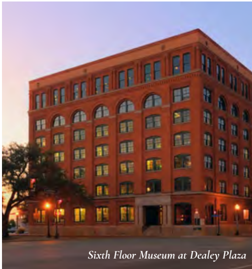
Sixth Floor Museum at Dealey Plaza