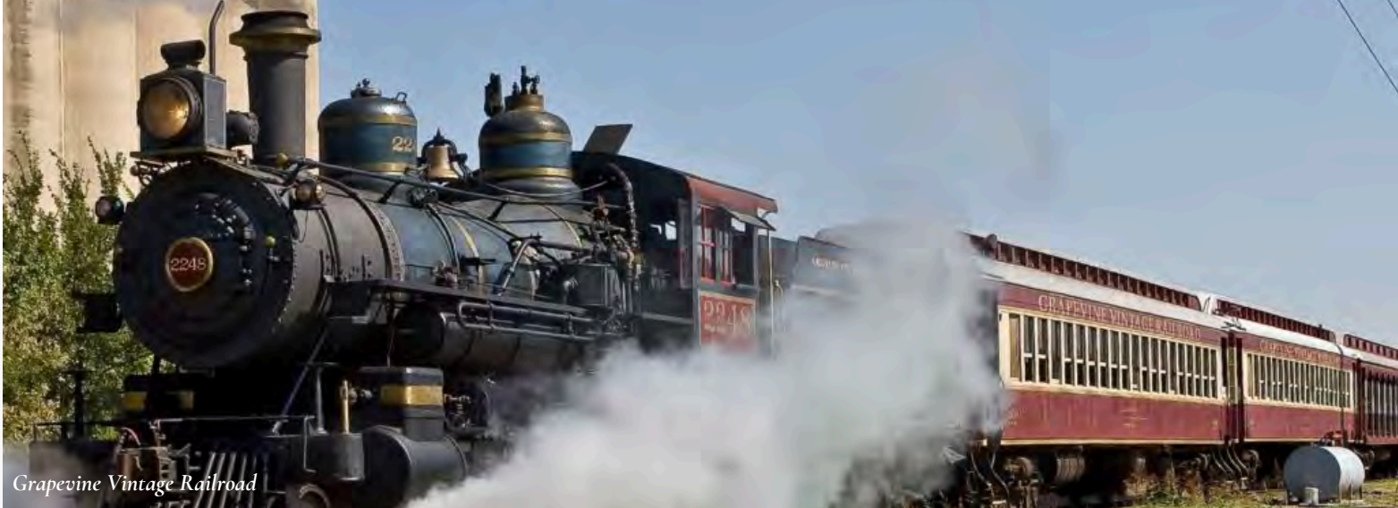
Grapevine Vintage Railroad