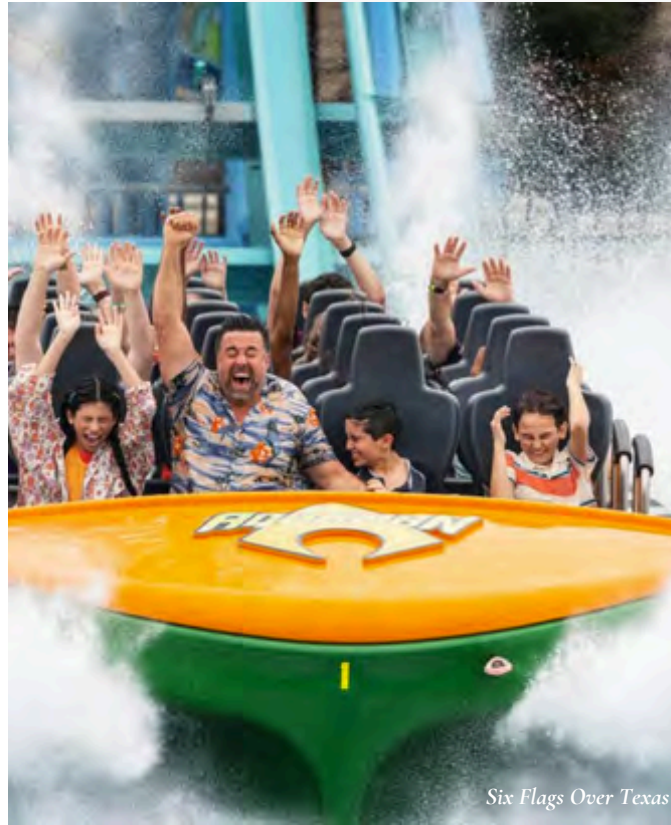
Six Flags Over Texas