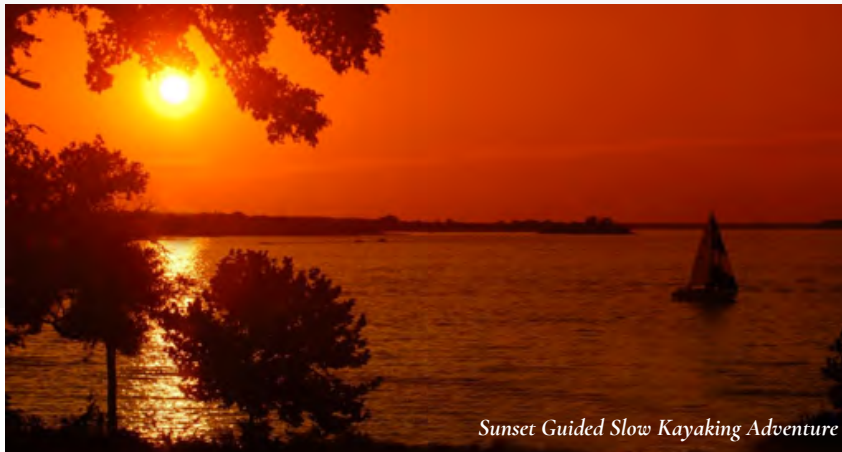
Sunset Guided Slow Kayaking Adventure