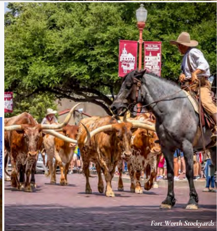
Fort Worth Stockyards

Start your morning at Historic Nash Farm, stepping back into 19th-century prairie life. Explore the preserved farmstead, wander historic buildings, and learn how Grapevine's early settlers lived and worked. Afterwards, visit the historic Grapevine Vintage Railroad and embark on a nostalgic journey to Fort Worth (weekends only – mid-week, take advantage of the regular TEXRail service). Begin your Fort Worth adventure at the famous Fort Worth Stockyards, witnessing the iconic cattle drive, exploring rustic saloons, and visiting the Texas Cowboy Hall of Fame. Enjoy lunch at a local steakhouse or chuckwagon-style eatery. Spend the afternoon at Sundance Square, browsing boutique shops, galleries, and cafés, or immerse yourself in world-class art at the Kimbell Art Museum, renowned for its diverse collection spanning classical to modern works. Return to Grapevine by early evening and enjoy dinner at Hop & Sting Brewing Co., perfectly rounding out a full day of heritage, culture, and authentic Old West charm.