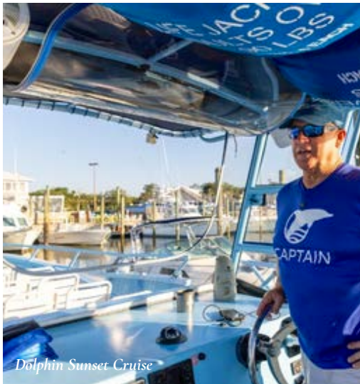
Dolphin Sunset Cruise