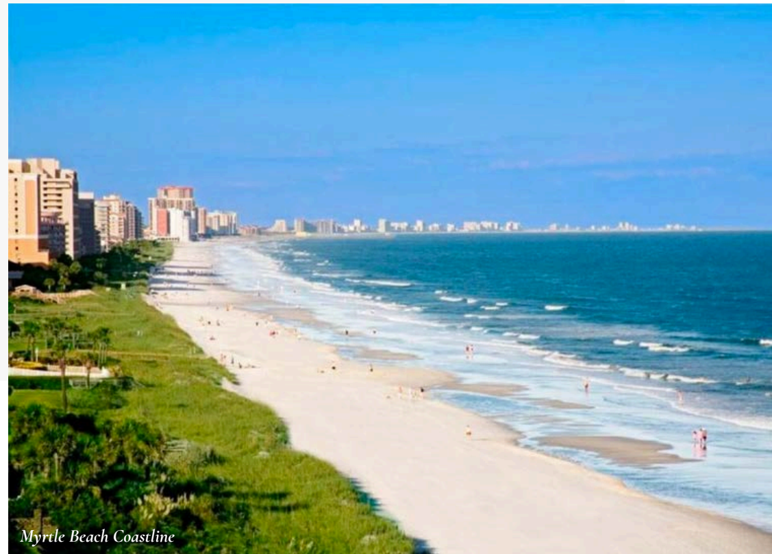
Myrtle Beach Coastline

Take an early morning stroll along Myrtle Beach's golden shoreline - quiet, unhurried, and the perfect way to soak in the coast one last time. Then, head downtown to Winna's Kitchen for a soulful Southern breakfast. Here, comfort food shines with grit bowls, ricotta pancakes, and chef-curated daily specials. Before you leave, be sure to ask your server to add "The No. 1 Special" to your tab - a heartwarming local tradition that pays for a meal for someone in need. Revisit the iconic Myrtle Beach Boardwalk to grab a bag of saltwater taffy, enjoy the sea breeze from a shaded bench, or go for a stroll along the historic Second Ave Pier taking in the amazing beach views and beach atmosphere. Stop for an early lunch at Tidal Creek Brewhouse for shrimp po'boys, Southern-style snacks, and local craft. And with sandy toes and sun-warmed memories, bid farewell to Myrtle Beach and head off to your next adventure or homeward flight, carrying memories of Southern charm and coastal beauty.