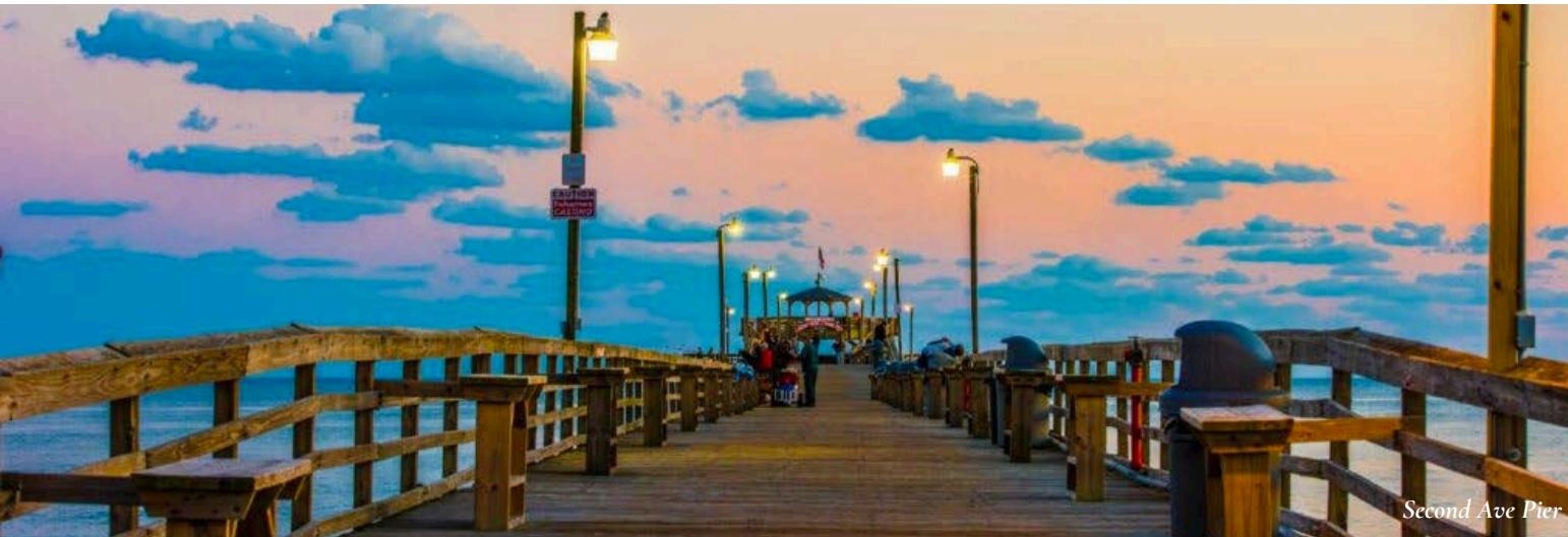
Second Ave Pier