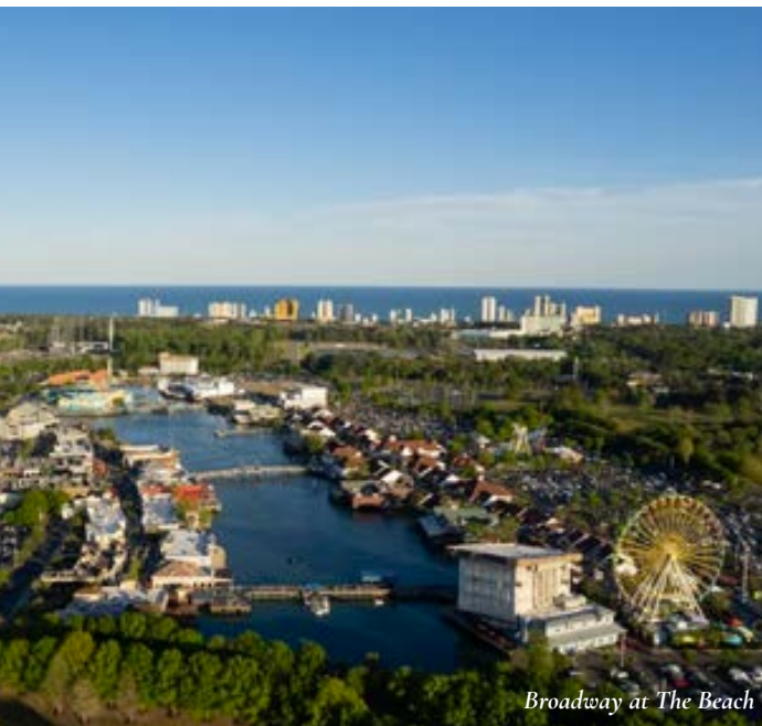
Broadway at The Beach

Start your day at Johnny D's Waffles & Bakery - famous for its red velvet waffles and shrimp omelettes. Then head to Broadway at the Beach , Myrtle Beach's premier entertainment hub. Visit Ripley's Aquarium , then test your putting skills at PopStroke , an interactive mini-golf experience designed by Tiger Woods, with two cleverly designed 18-hole courses, ball tracking, and on-course food and drink delivery. This afternoon, explore Myrtle Beach's cultural roots with visits to Charlie's Place - a former juke joint that played a key role in the Chitlin' Circuit - and the Myrtle Beach Coloured School Museum , which preserves the city's African American educational history. As the sun begins to dip, embark on a Dolphin Sunset Cruise . Sail through the scenic waters of Murrells Inlet, spot playful dolphins, and soak in the sweeping views. Finish with a late-night feast at The Original Benjamin's Calabash Buffet , offering more than 170 Southern-style dishes in a nautical-themed setting.