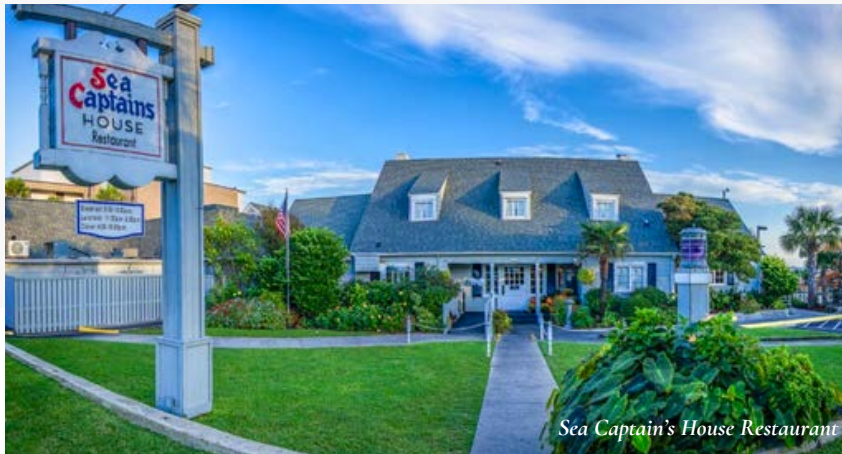
Sea Captain's House Restaurant