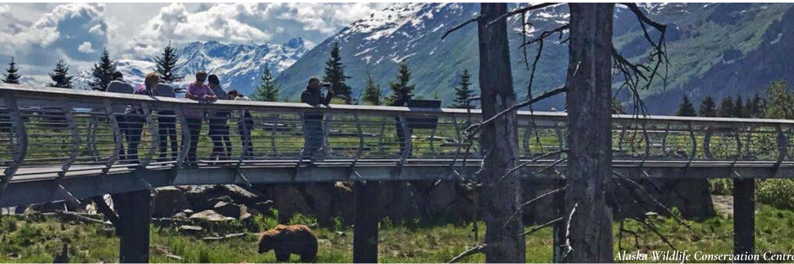
Alaska Wildlife Conservation Centre