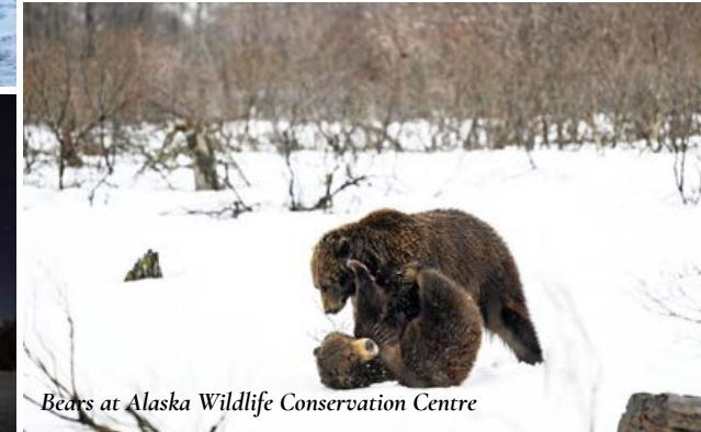
Bears at Alaska Wildlife Conservation Centre