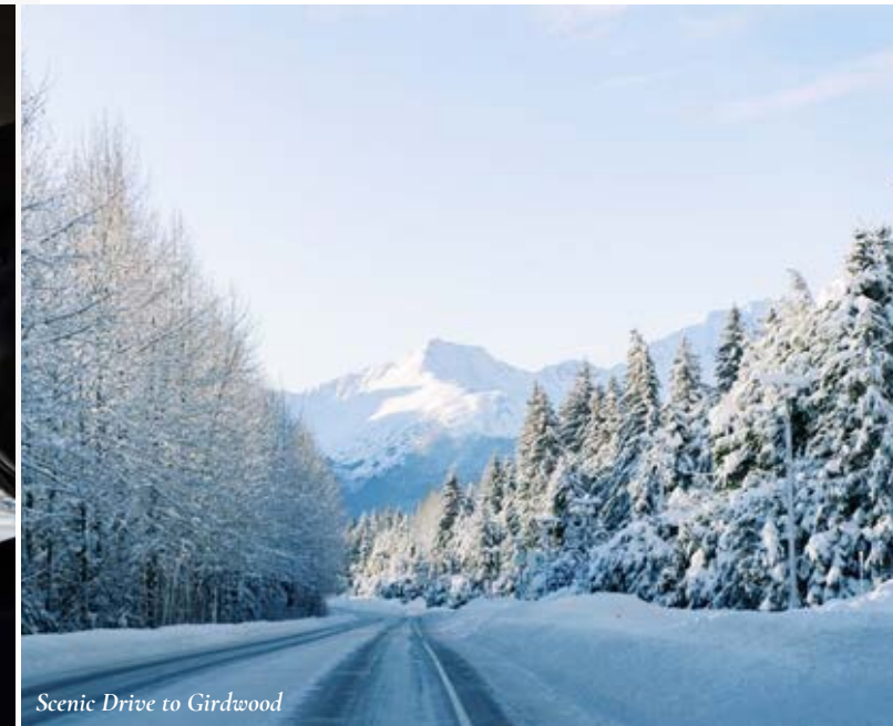
Scenic Drive to Girdwood