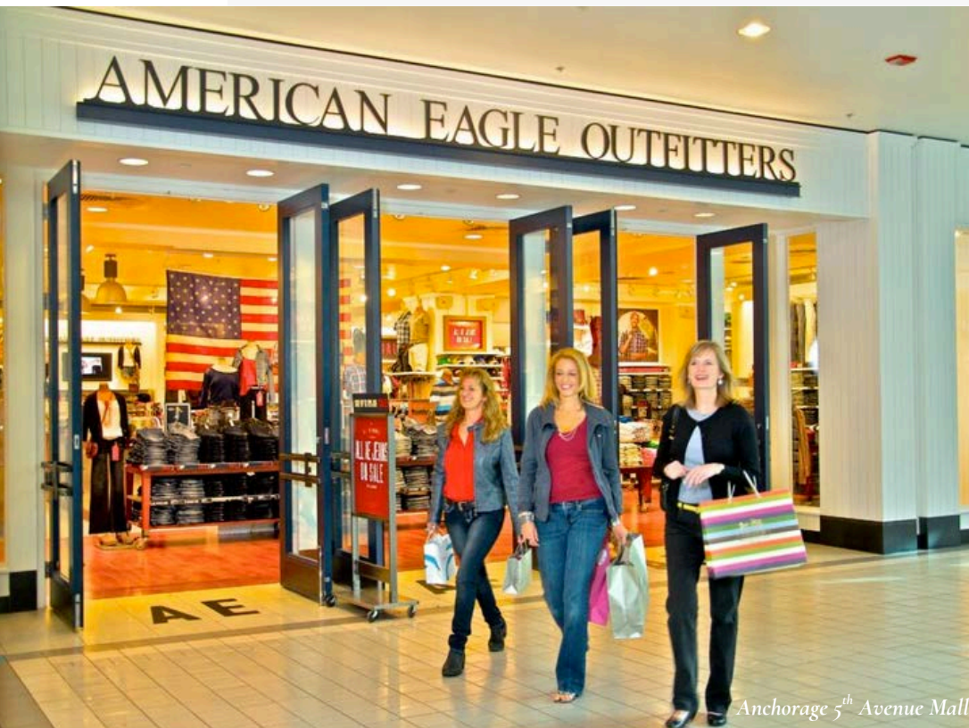
Anchorage 5 th Avenue Mall

On your last morning in Anchorage, you may like to enjoy some retail therapy at the Anchorage 5th Avenue Mall, downtown's premier shopping destination with over 110 stores—from popular global brands to unique Alaskan shops like Alaska Wild Berry Products. Browse for souvenirs, local crafts, and last-minute gifts. If time allows, consider visiting the Alaska Native Arts Foundation gallery, showcasing exquisite Indigenous art and culture, or take a peaceful stroll through Town Square Park, a lovely green space in the heart of downtown. It's the perfect spot to savour the crisp mountain air and quietly reflect on your journey. Most travellers depart in the early afternoon, either catching flights home or heading onward to their next USA destination—or continuing their Alaskan adventure by cruising out of Whittier. Whether flying out or setting sail, Anchorage offers a smooth, convenient gateway to whatever comes next. As you leave, take with you the memories of wild landscapes, rich culture, and Alaska's untamed spirit.