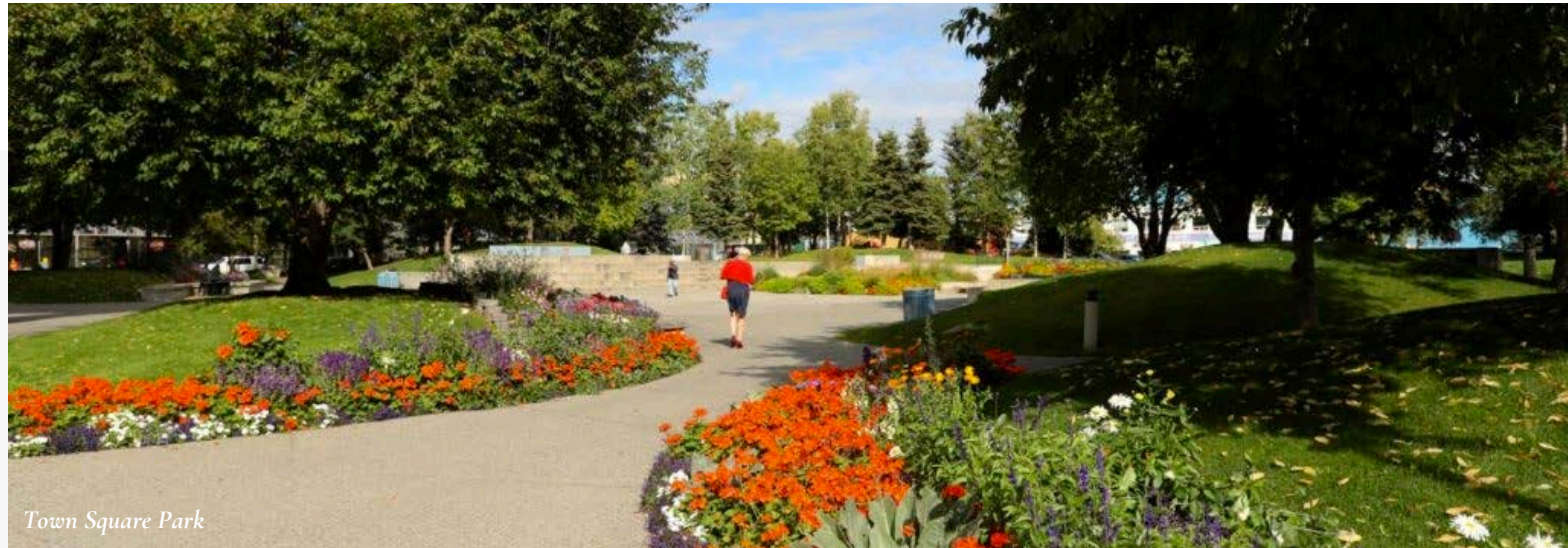
Town Square Park