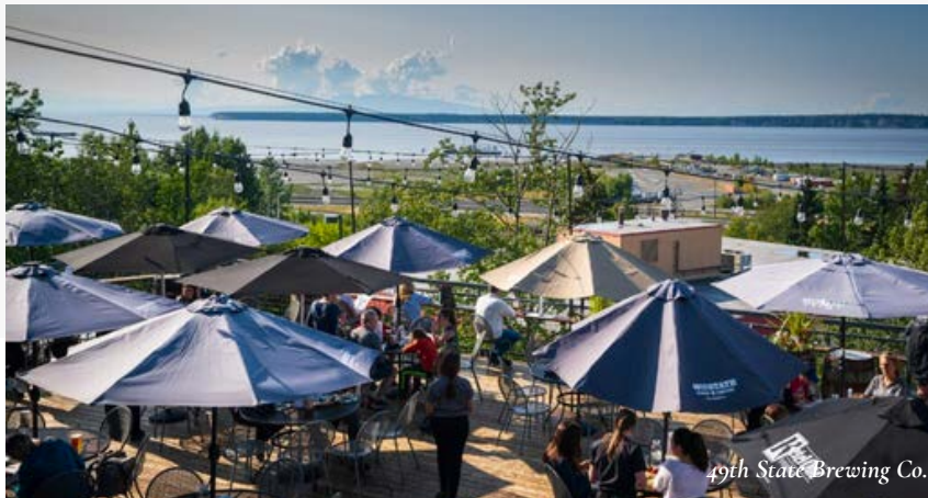
49th State Brewing Co.