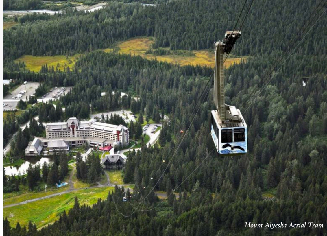
Mount Alyeska Aerial Tram

Today is all about choice and adventure with our unique Choose Your Adventure option - centred around the iconic Alaska Wildlife Conservation Centre. This sanctuary is home to rescued bears, moose, bison, and other native Alaskan animals living in a spacious, natural setting. Choose one of two unforgettable pairings: ride the Mount Alyeska Aerial Tram for sweeping panoramic views of the towering Chugach Mountains before visiting the wildlife centre. Alternatively, enjoy a scenic drive along the stunning Turnagain Arm, with stops at Beluga Point and Bird Point, prime spots for breathtaking coastal vistas and wildlife sightings, followed by a peaceful cruise on glacier-carved Portage Lake. Both options deliver an incredible blend of dramatic scenery and unforgettable wildlife encounters. Return to Anchorage and unwind with a casual dinner at Moose's Tooth Pub & Pizzeria — a local favourite known for its legendary handcrafted pizzas, unique house-brewed beers, and lively atmosphere — the perfect end to a day of unforgettable outdoor discovery.