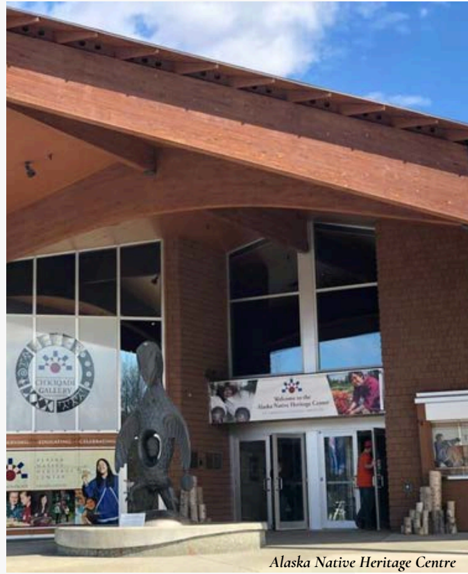
Alaska Native Heritage Centre

Begin your day with the Deluxe Anchorage Trolley Tour, a 90-minute journey showcasing the city's history, nature, and local charm. Your guide will share fascinating stories as you pass iconic spots like the Alaska Railroad Depot and the Captain Cook Monument — a name Kiwis will definitely recognise. Keep your eyes peeled for moose sightings and enjoy stops at Lake Hood, the world's busiest floatplane base, and Ship Creek, where locals fish for King Salmon. Visit Earthquake Park to learn about the powerful 1964 quake, then take in sweeping skyline views from Point Woronzof. Spend your afternoon immersed in culture — either at the acclaimed Anchorage Museum or the Alaska Native Heritage Centre, where you can experience authentic Indigenous storytelling and traditions. This evening, treat yourself to dinner at Simon & Seafort's, one of Anchorage's most iconic dining spots. Known for its Alaskan seafood, craft cocktails, and unbeatable views over Cook Inlet, it's the perfect setting to relax and toast the day's discoveries.