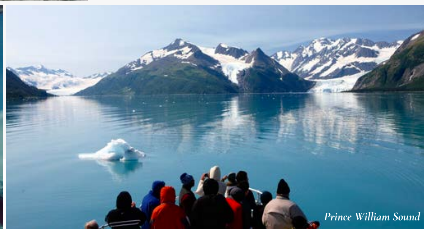
Prince William Sound