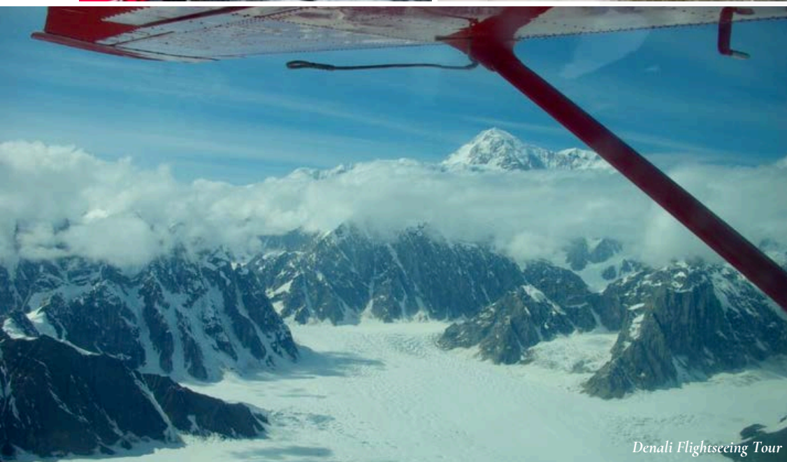
Denali Flightseeing Tour

Today is yours to personalise — a full day free to craft your own unforgettable Alaskan adventure with Travel USA's expert guidance. Whether you seek a close-up wildlife encounter, breathtaking aerial views, scenic cruising, or an exhilarating glacier hike, the choice is completely yours. Consider the iconic Bear Viewing at Katmai , a fly-in experience available from late June to July, where you'll witness majestic brown bears fishing for salmon — a once-in-a-lifetime wildlife spectacle. Alternatively, take to the skies with a Denali Flightseeing Tour departing from Anchorage's Lake Hood, offering stunning aerial views of Denali and Alaska's vast wilderness — a photographer's dream come true. For water lovers, a Prince William Sound Cruise reveals scenic fjords, towering glaciers, and abundant marine wildlife. Or, if you prefer active exploration, hike the stunning Matanuska Glacier , Alaska's largest accessible glacier. The choice is entirely yours — Travel USA is here to help craft your perfect day. We create the adventure; you create the memories!