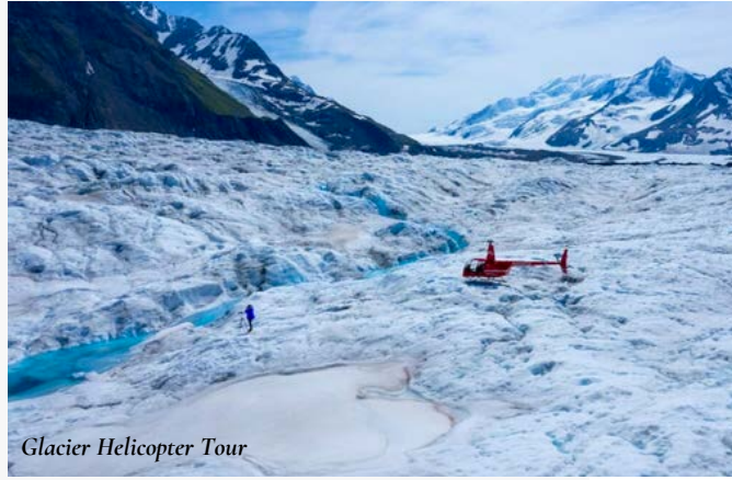
Glacier Helicopter Tour

Contact Travel USA for your personalised Fall/Winter itinerary