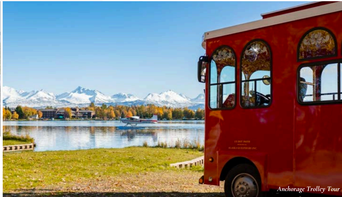
Anchorage Trolley Tour