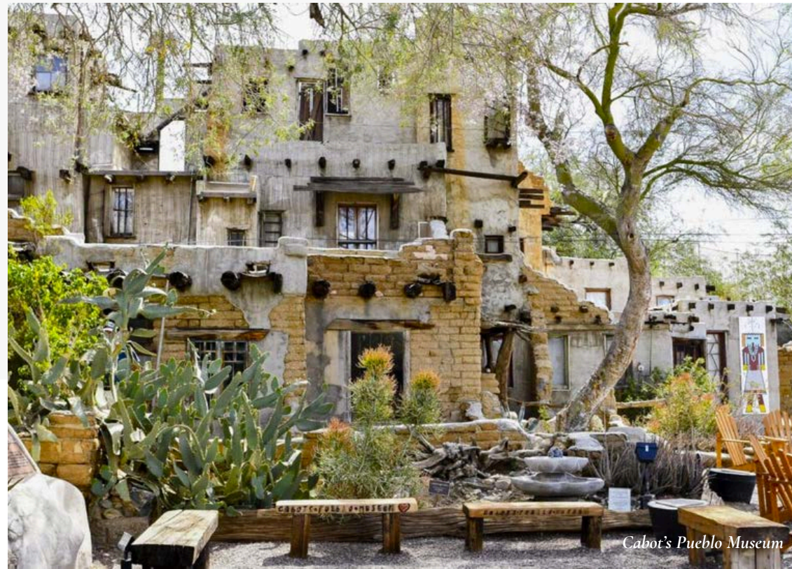
Cabor's Pueblo Museum

A special day begins with a visit to Cabor's Pueblo Museum, a Native American-inspired adobe building offering fascinating insights into the lives of early desert settlers. This afternoon you will embark on a Joshua Tree Adventure Open Air Hummer Sunset Tour , a thrilling 3-hour off-road experience through Joshua Tree National Park. Ride in an open-air Hummer for panoramic views of the park's rugged terrain, iconic rock formations, and diverse wildlife. As the sun sets, the desert's colours and light create an unforgettable scene. Afterward, head to Pioneertown , a charming Old West-style town built in the 1940s as a movie set. Stroll the town and enjoy dinner at Pappy & Harriet's , known for its lively atmosphere and delicious BBQ. Round out your Joshua Tree adventure with Professional Stargazing , where you'll relax in zero-gravity pods under the park's internationally recognised dark skies as expert guides lead you through constellations and celestial objects, offering powerful telescopes to reveal galaxies, nebulae, and more.