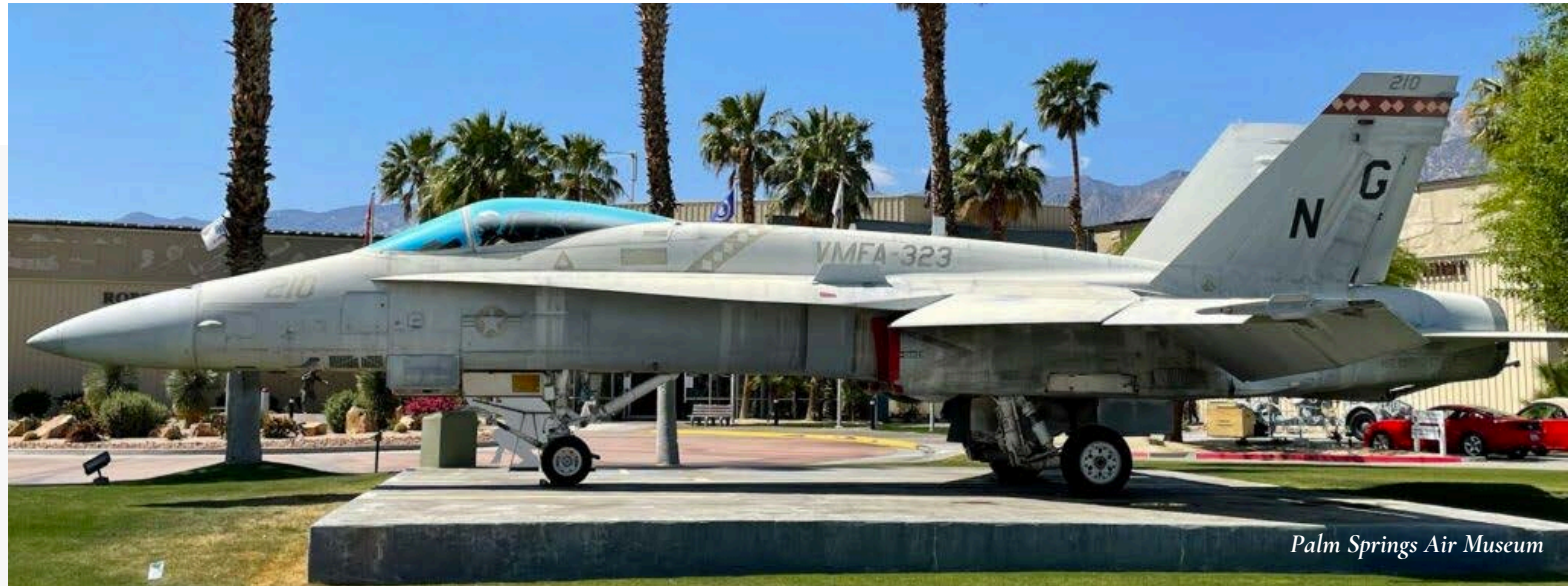
Palm Springs Air Museum