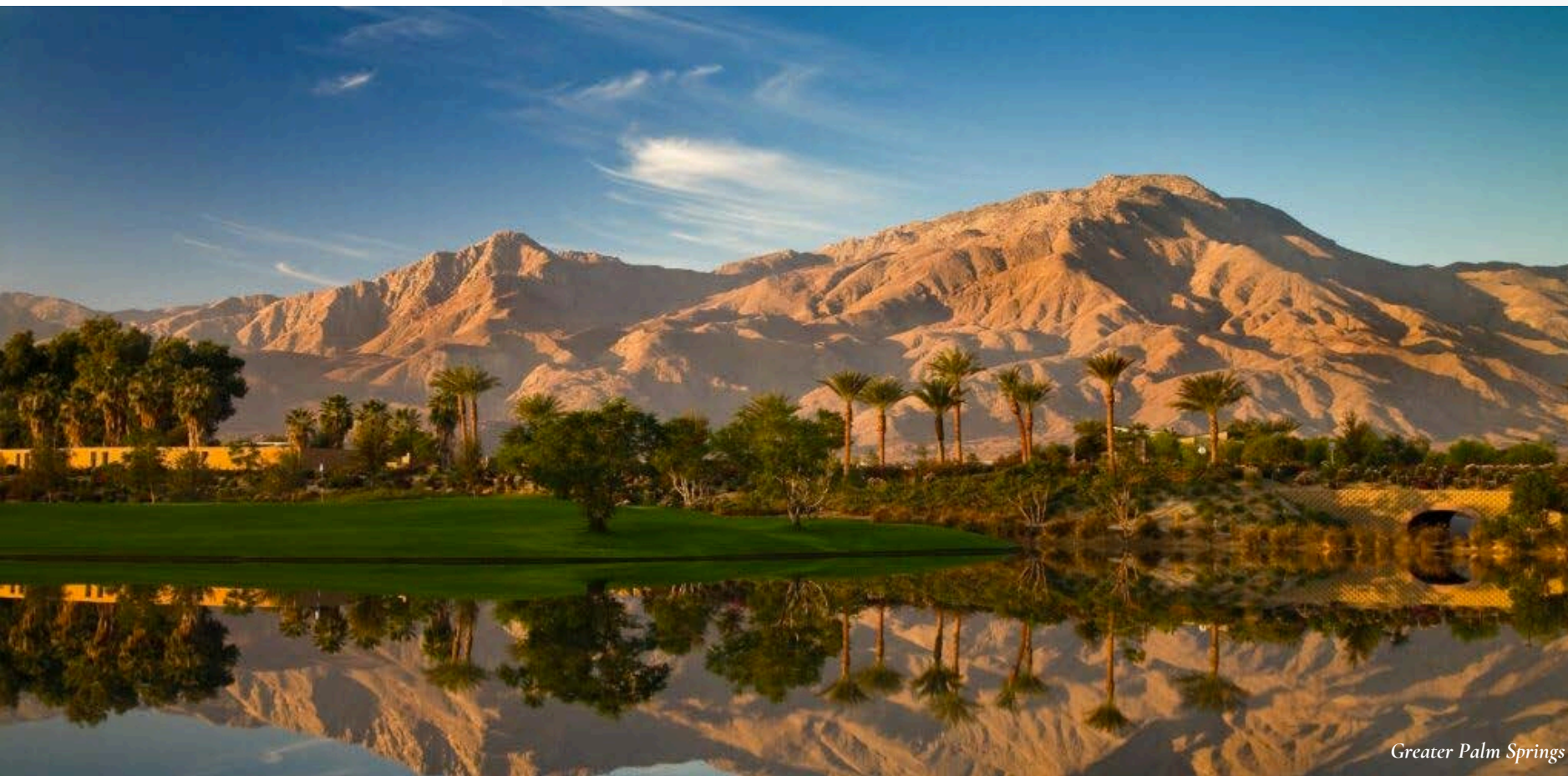
Greater Palm Springs