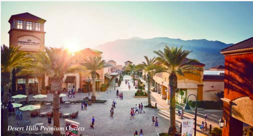
Desert Hills Premium Outlets