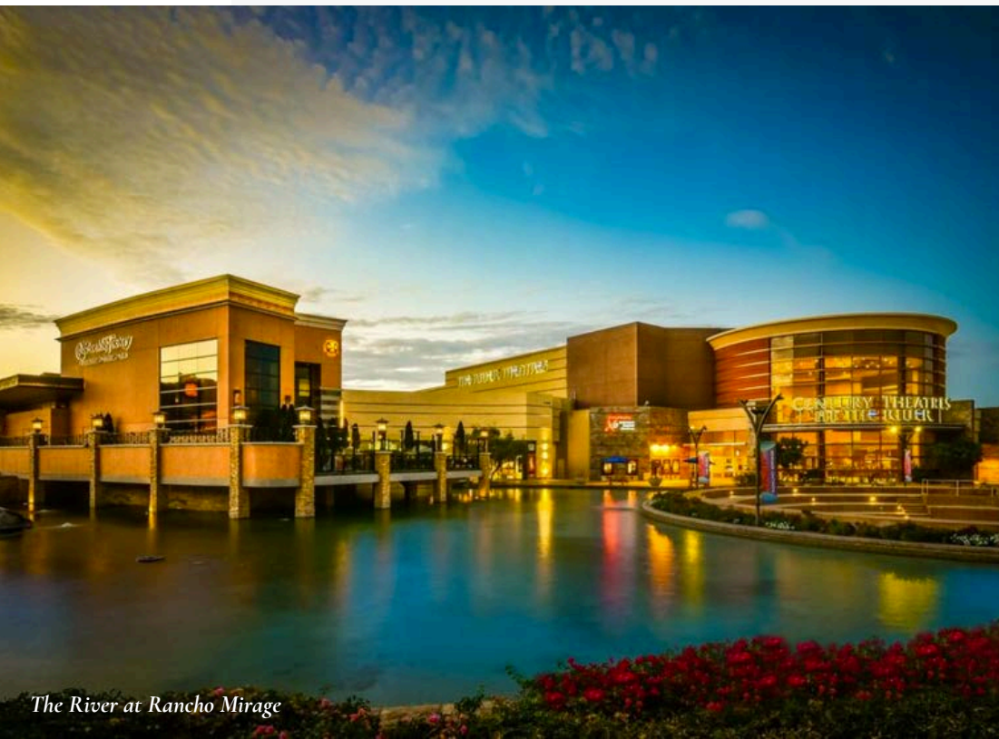
The River at Rancho Mirage

On your final day in Palm Springs, take it easy and enjoy the desert's serene beauty. Start with a relaxing breakfast at one of the local cafes, then perhaps head to The River at Rancho Mirage for a leisurely shopping experience. Browse through a mix of retail stores, dining options, and entertainment, perfect for picking up last-minute souvenirs or treats. Afterward, revisit a favourite attraction from your trip. Take another stroll through Palm Springs' downtown or head to the Palm Springs Air Museum , where you can explore aviation history and view fascinating aircraft exhibits. For those seeking one final desert adventure, consider a peaceful return to Joshua Tree National Park. Take a short hike or scenic drive through the park to enjoy its unique landscape one last time. Or just sit around the pool, relax and savour your last moments in the desert before your late afternoon departure home or on to your next destination.