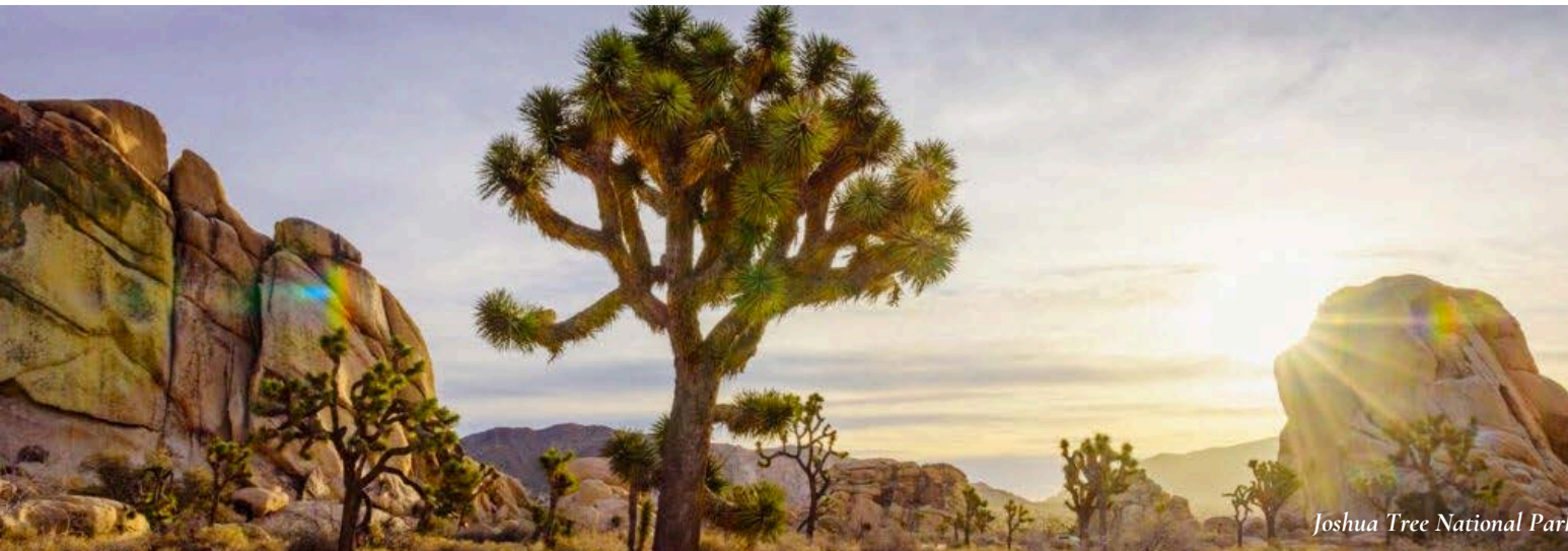
Joshua Tree National Park